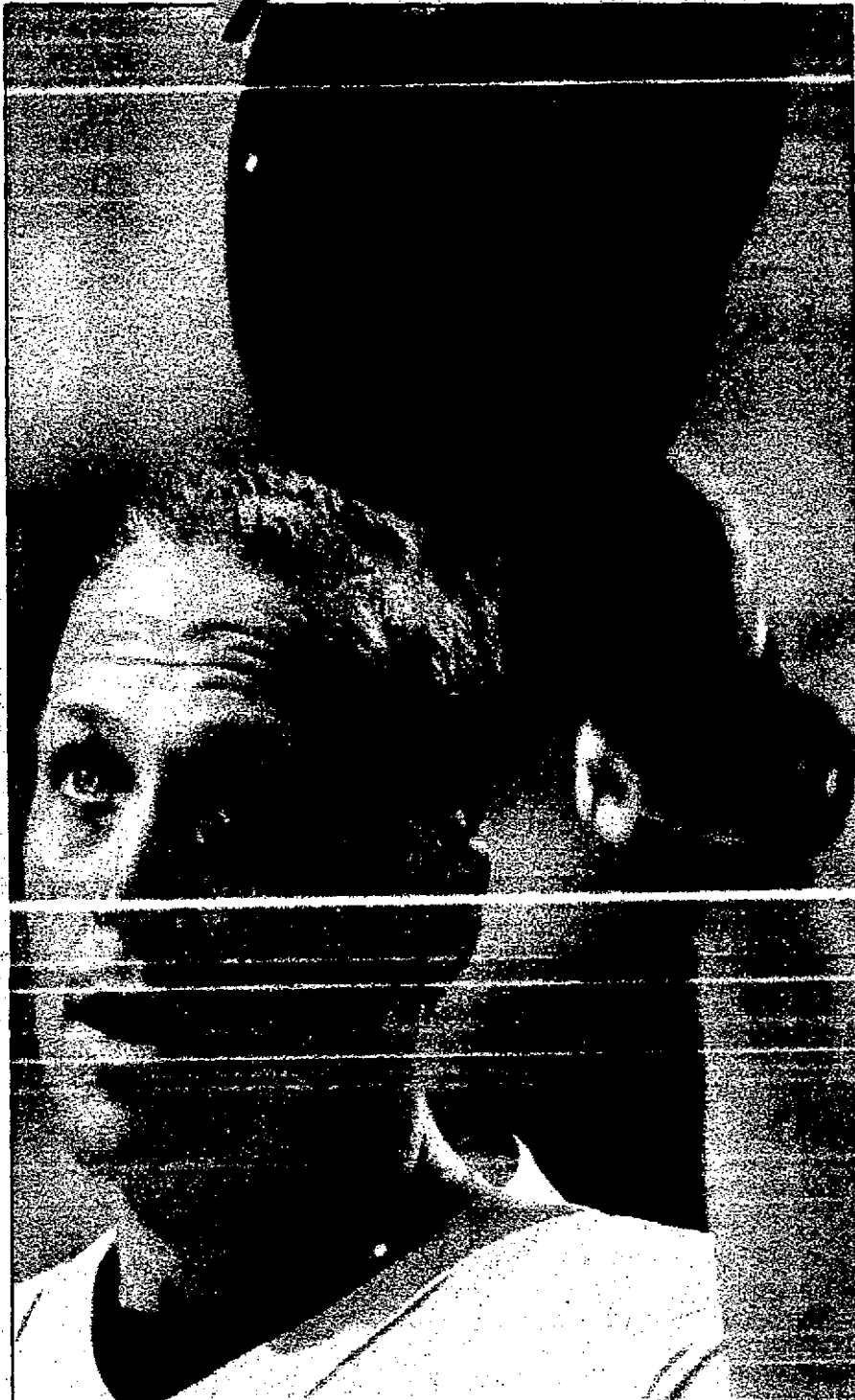
Cal Ripken ties Lou Gehrig's consecutive games record.